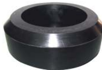
Packer Elements Nitrile Downhole